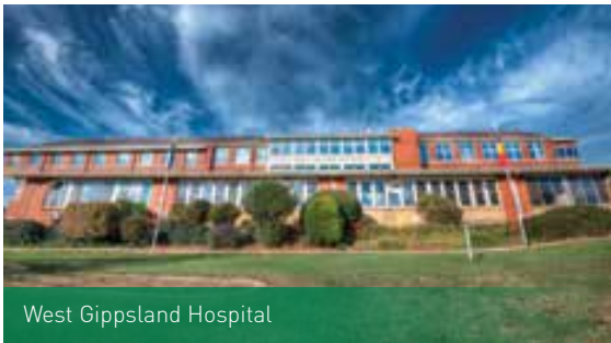
West Gippsland Hospital

If you are looking for some culture, the West Gippsland Arts Centre is a thriving hub of live entertainment. Catch up with friends before or after the show at local coffee shops, cafés and restaurants.