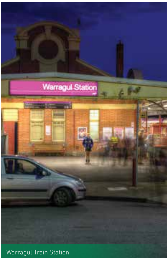
Warragul Train Station